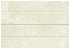
613280 Shale Scored 1 300 x 200 x 10mm SHLE1E