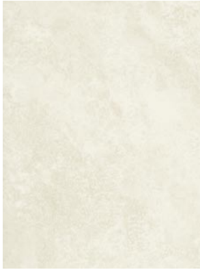
613278 Shale 400 x 300 x 10mm SHLE1A