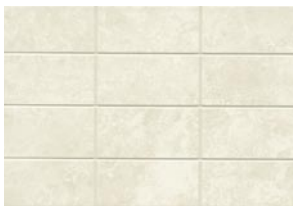
613281 Shale Mosaic 2 300 x 200 x 10mm SHLE1A